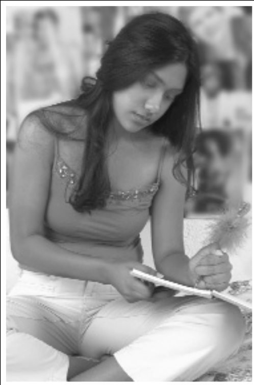
Help your students respond to the world around them through poetry.

CORBIS (MODELS POSED FOR ILLUSTRATIVE PURPOSES ONLY)